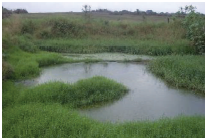
Fig.3: These two pictures show another lagoon before and after treatment with MICROBE-LIFT® /DFP