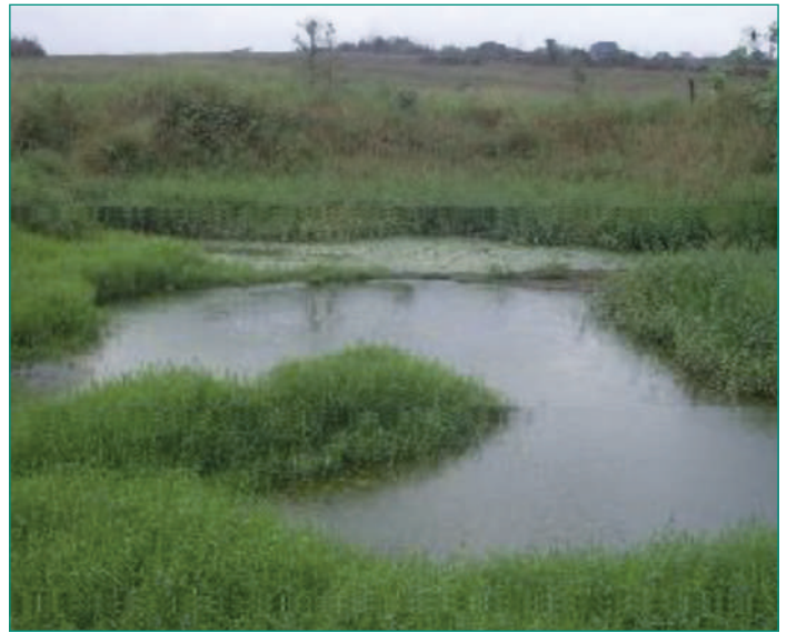
Fig 4: Another lagoon cleaned by highly active microbes in MICROBE-LIFT® /DFP shows dramatic improvement.