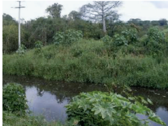
Fig.1: Shows two pictures representing the condition of the lagoon before and after treatment. These pictures show dramatic improvement, eliminating the surface crust in this lagoon.