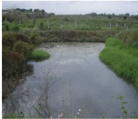
Fig.2: This figure shows another lagoon before and after treatment. Visible crust on a lagoon is almost completely removed after treatment with MICROBE-LIFT® /DFP.