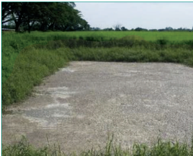
Fig 5: The following pictures show an additional three lagoons cleaned by MICROBE-LIFT® /DFP with the before pictures on the left and the treated lagoons on the right.