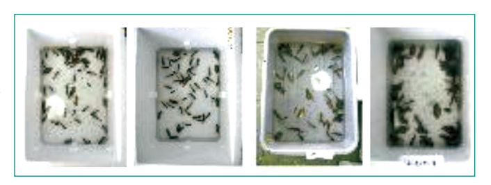
Fig. 4: When fish were transferred to fresh water, the ML treated fish in the two tanks on the left were more active and ready to eat. Those in the Product K treated tank (middle right) recovered after an additional 8 hours but those from the control bag showed toxicity and died within 72 hours.

The fish in the tanks were fed at 53 hours. The ML treated fish started feeding immediately while the Product K treated fish started feeding about 30 minutes later. The control fish did not feed. At 72 hours the fish were examined again. All the fish in the control tank had died while those in the other tanks remained active, with no signs of stress, and they were feeding normally.